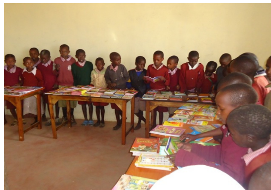
Growing readers one book at a time.

The first set of books has already been purchased and is now in the library for the community. As the year progresses, more books will be purchased for the library. The community of Loita seems to be in love with the center, and the kids are thrilled to have brand new books for their further development in school.