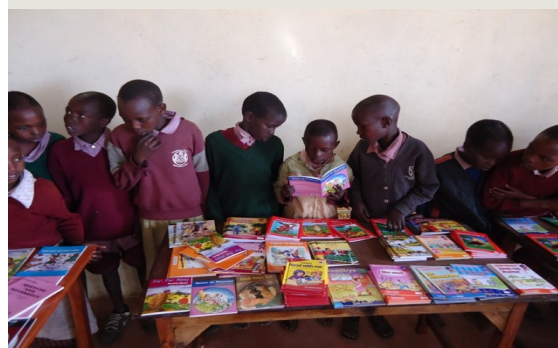
Children at Greystone Learning Center in Loita, Kenya are EXCITED as they explore their new books