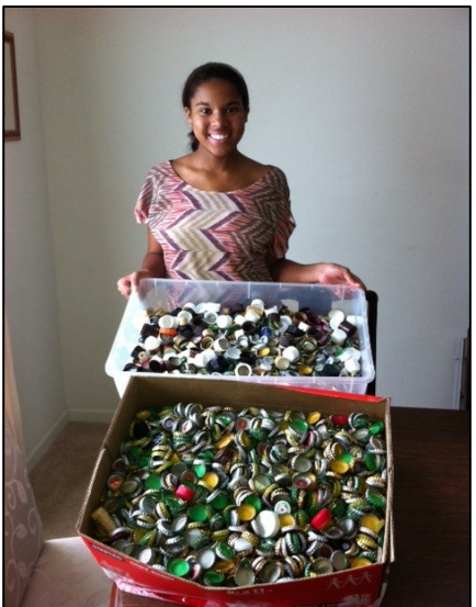
Through a collaborative effort from three states over 70,000 bottle caps were sent to the women of the Massai tribe! The ALL Team collected over 11,000 bottle caps.