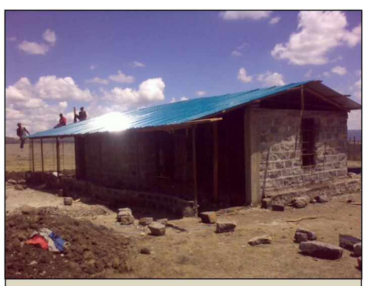
Greystone Learning Center in Progress Loita, Kenya