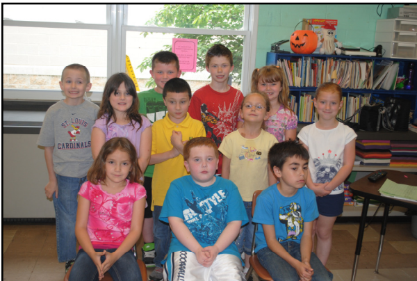
Students from Whitehall Elementary School