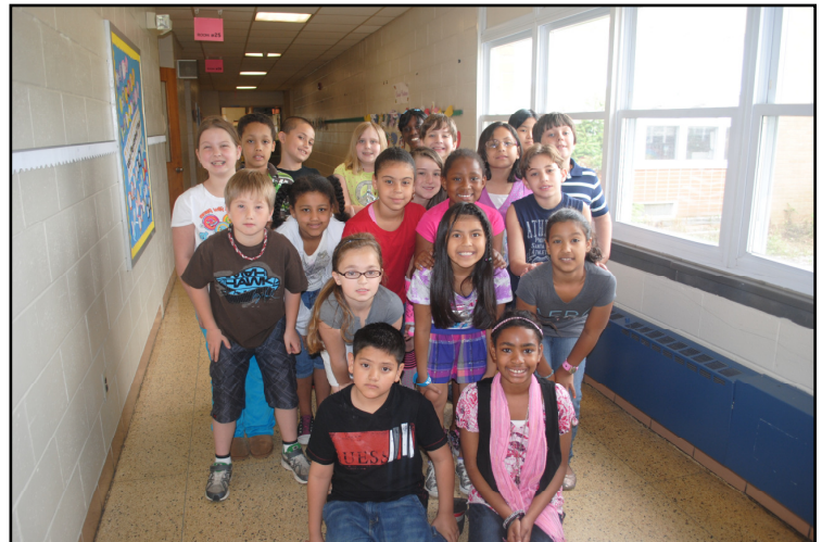
Students from Holly Glen Elementary School Above and two bottom photos- students are ready to READ all they can during the month of April.