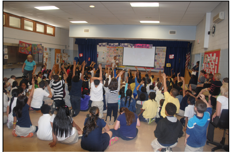
Lindenwold Elementary School - #4 "Pep Rally" for the RAYC™