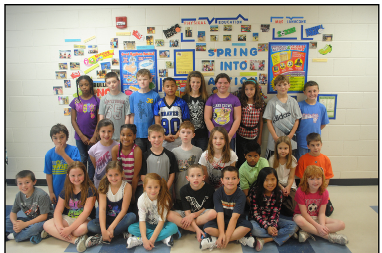
Students from Radix Elementary School