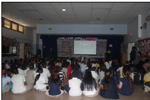
Students from Lindenwold Elementary School