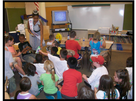
RAYC – Read ALL You Can – May 2010 Program specifically designed initially for Oak Knoll where classrooms in each grade competed to read as many books as they could. Total number of books read at Oak Knoll School was 4,984. Classroom winners received a Pizza Party. All students received a RAYC bookmark & coupon for Water Ice.