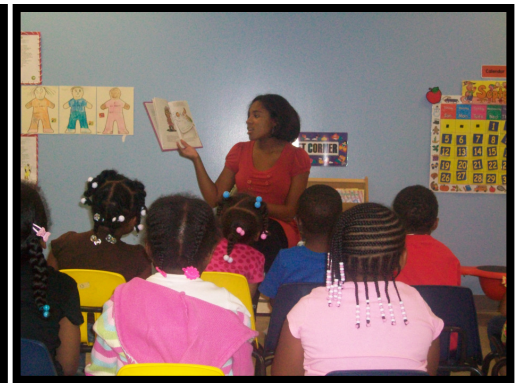
"Storytelling with Adele" – June 2010