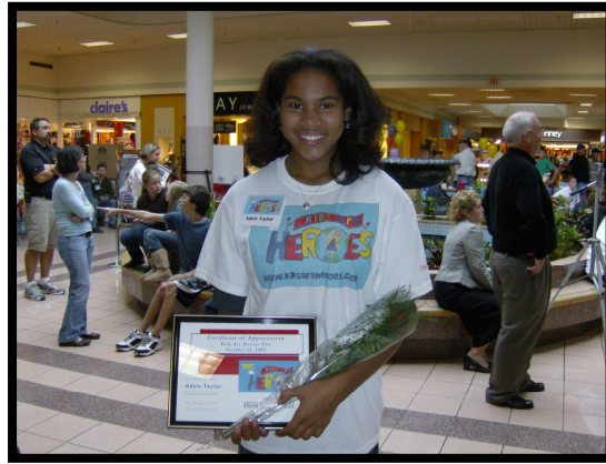
Adele – Kids Are Heroes Recipient October 2009 - Maryland