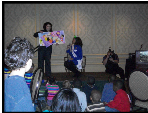
"Storytelling with Adele" – Autism Event January 2010 - Pennsylvania